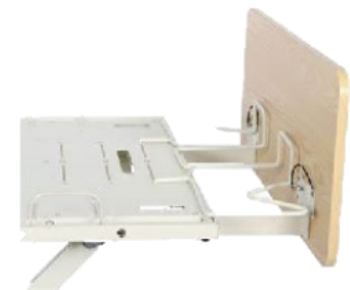
Tool free length extension