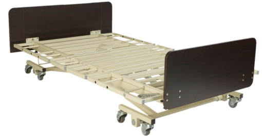
7" Low bed height