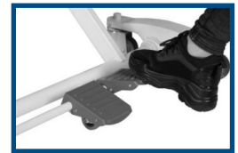
ONE-STEP LOCK & UNLOCK